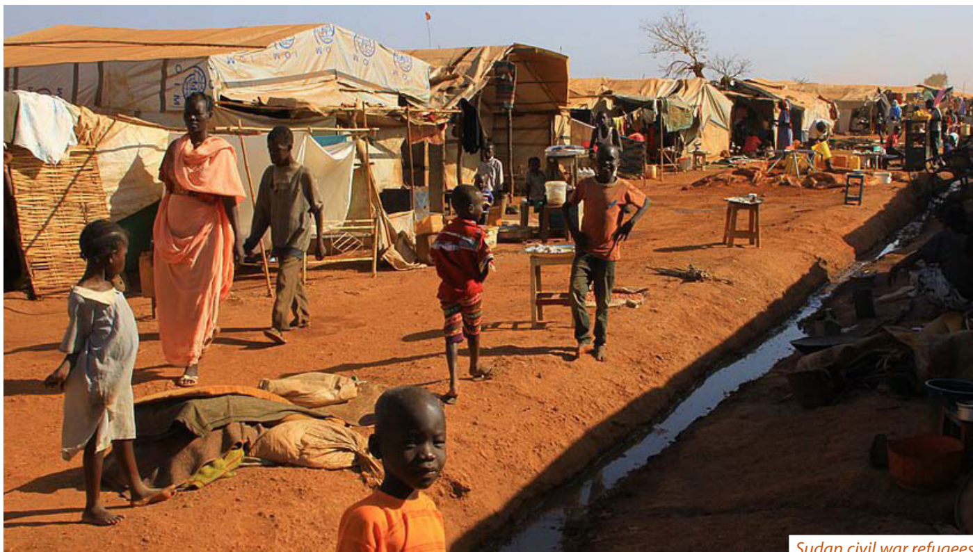
Sudan civil war refugees