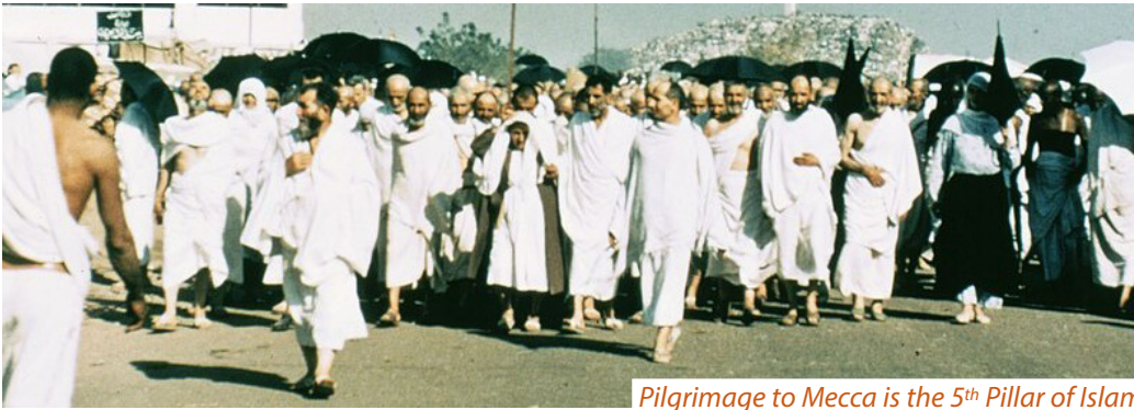
Pilgrimage to Mecca is the 5 th Pillar of Islam